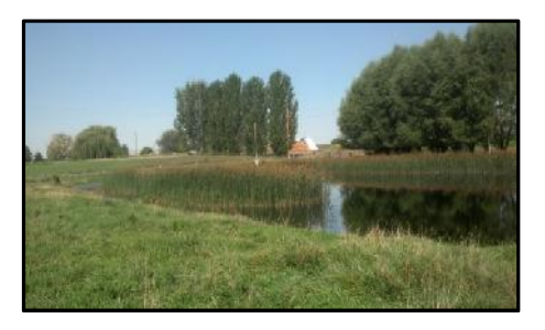
The pumper pond

20 llamas, 3 dogs, 3 cats and numerous chickens were on the property. The dogs, cats and chickens had free run of the property. The llamas are divided based on gender between the pastures. The females (13/20) are in the pasture with the pond. The males (1/20 intact, 5/20 gelded) were in the adjoining pasture. The first deceased gelded male resided in this pasture. A male (1/20 intact) had a small pasture to himself adjacent to the other males' pasture. The second deceased gelded male also resided in this pasture. The third deceased intact male resided in a small pasture to himself adjacent to the females.