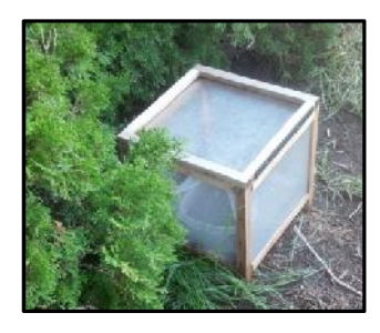
1 of 2 ground insect traps