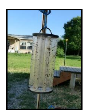
1 of 2 biting fly traps

All the llamas are fed Llama Supplement Plus (Nutritional Services, Inc.) in addition to their pasture in the summer and the supplement and hay through the winter months. Each